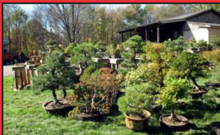
These two photos complements of Bob's Facebook