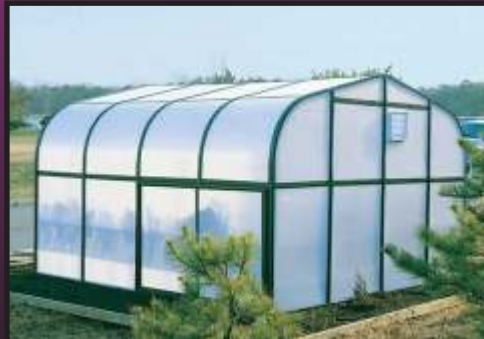
Poly House