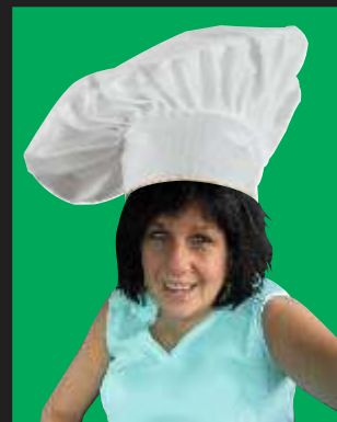
Photograph and Photo Manipulation by Cindie Bonomi