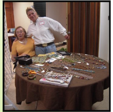
Our Jewelry Guys