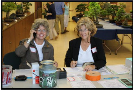
Front Desk "Meet & Greet"